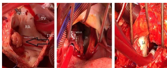
Figure 1: (a) Intraoperative image of right atrial (RA) thrombus. Superior vena cava (SVC), Inferior vena cava (IVC), Tricuspid valve (TV). (b) Intraoperative image of left atrial (LA) thrombus. Superior vena cava (SVC), Inferior vena cava (IVC), Right atrium (RA), (c) Intraoperative image of left atrial (LA) thrombus. Superior vena cava (SVC), Right atrium (RA), Mitral valve (MV).

A 41-year-old male presented with severe shortness of breath was admitted to the emergency department. Echocardiography revealed thrombus on the left atrium, right atrium, inferior vena cava, and patent foramen ovale, pulmonary artery pressure was 90 mm Hg and right ventricle was globally hypokinetic. Computed tomography showed total occlusion of the right main pulmonary artery and huge thrombus on the left main pulmonary artery and branches. Emergency surgery was performed via right atriotomy, left atriotomy and pulmonary arteriotomy. Thrombus debris was excised from right atrium, left atrium, inferior vena cava, right main pulmonary artery and left main pulmonary artery (Figure 2a, 2b). Patient's foramen ovale was repaired with pericardium. Nevertheless, urgent diagnosis was made and surgery was performed, patient did not weaned from heart-lung machine due to globally hypokinetic right ventricle and died.