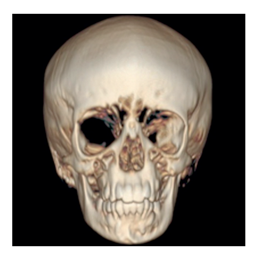
Figure 4. The anterior volume rendered 3D CT image showed details of a bony defect in the right orbital region

To investigate bone abnormalities and evaluate infectious process such as osteomyelitis MDCT was performed and volume rendered 3D CT images were obtained. Axial MDCT images showed absence of right sphenoid wing (Fig 3) and no sign of infection. The anterior volume rendered 3D CT image showed details of a bony defect in the right orbital region (Fig 4).