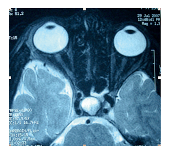
Figure 1. Axial T2 weighted MR image demonstrated enlarged right middle cranial fossa