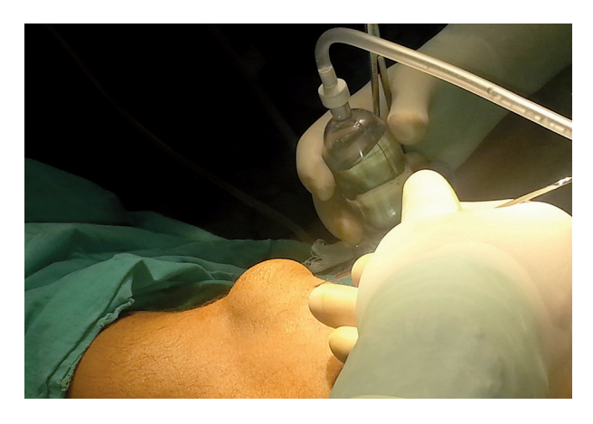
Figure 3. When bursae Inflated with fluid