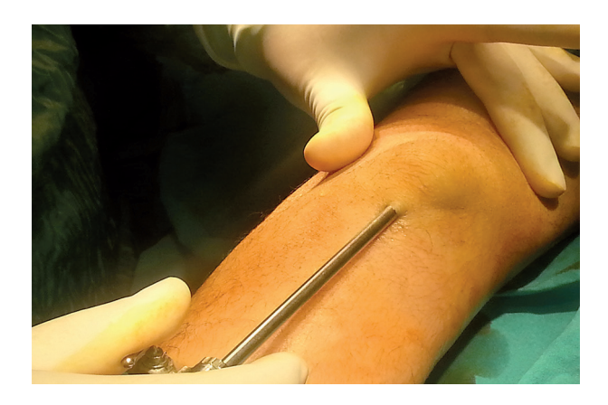
Figure 2. In the operation, when the bursae were entered with a trocar