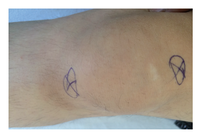
Figure 1. View of arthroscopic portals in the prepatellar bursitis

cleaned with a shaver, the walls of the cyst on both the subcutaneous and deep sides were removed with a punch.