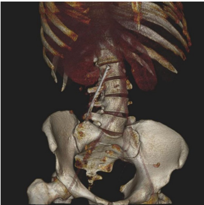
Figure 2. Abdominal three dimensional computed tomography of patient