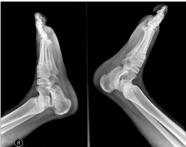
Figure 1. Lateral radiograph of both ankles show diffuse soft tissue swelling of the plantar sides

ment and inability to walk unaided. As the result of a fall from height approximately 3 months previously, the patient underwent surgery in the Neurosurgical Clinic for L1 and L2 vertebrae fractures and bilateral calcaneus fracture. In the operation T11-L3 posterior stabilization and T12- L2 laminectomy was performed. Plaster casts were applied to both feet for 45 days for the bilateral calcaneus fractures and 2 weeks after the plasters were removed, the complaints started of pain, swelling and redness in both feet. There was nothing remarkable in the patient history. In the locomotor system examination, muscle strength was bilateral L2, L3: 5/5, L4, L5, S1: 1/5, bilateral L4, L5, S1 hypoesthetic, anal sensation was preserved, DTR could not be taken. Movement of both ankles was limited and painful, both feet had edema and pink-purple color changes, were cold and sensitive. The patient was able to walk a short distance with help. There was no fecal and urinary incontinence. Residual urine volume was 20 cc. Laboratory findings were normal, including complete blood count, erythrocyte sedimentation rate, C-reactive protein, rheumatoid factor, kidney, liver and thyroid function tests, serum calcium, phosphorus, alkaline phosphatase levels. In the radiographic examination, the ankle radiographs of both feet showed diffuse soft tissue swelling of the plantar sides (Figure 1).