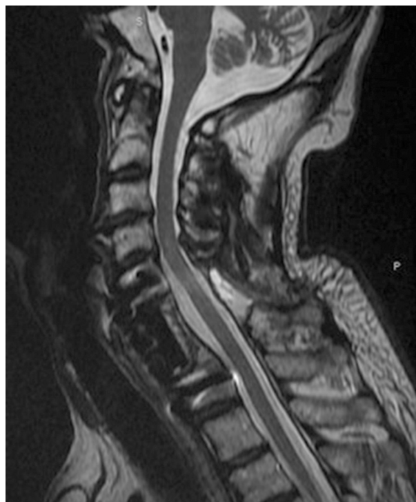
Figure 2. Axial sections of the level of C6 vertebra revealed numerous T1-hypointense, T2-hyperintense cystic lesions located in both laminae and spinous process which do not show contrast enhancement after contrast administration and the biggest one was at the level of right-lamina, 12x7 mm in size and expansile, also some cysts had septa. Especially the posterolateral parts of spinal cord seems pressed by the defined cystic lesions.